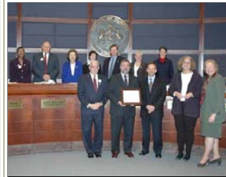
Wetland Studies and Solutions, Inc. ( High Resolution Photo )