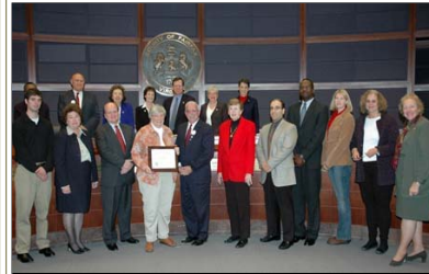
Northern Virginia Soil and Water Conservation District ( High Resolution Photo )