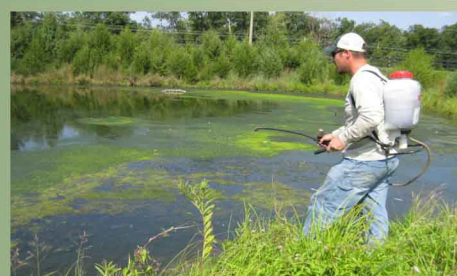
Certified staff applying herbicides to eliminate algae blooms

WSSI engineers inspect dam embankments and outlet works to ensure their structural integrity as well as to highlight potential issues that may lead to future problems.