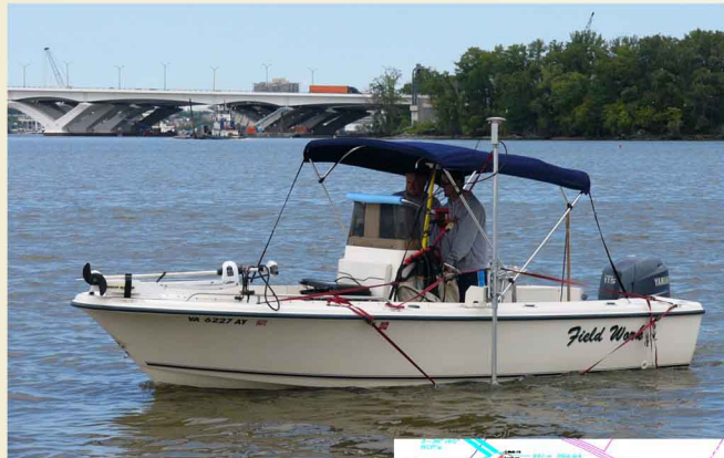
WSSI Surveyors performing a Bathymetric Survey on the Potomac River