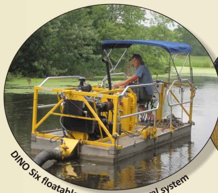
DINO Six floatable sediment removal system

◆ Sediment is excavated from the bottom of the pond and carried away through a pump for drying in de-watering tubes. The dewatering tubes are allowed to dry and the sediment is easily removed for transport and disposal, or used on site.