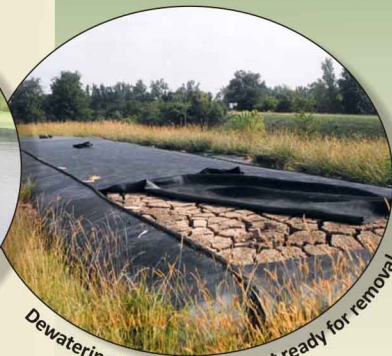
Dewatering tube and sediment ready for removal