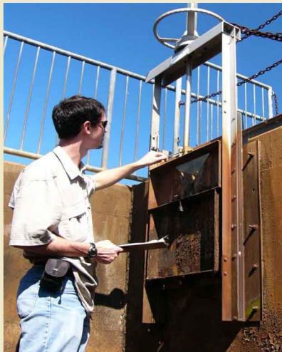
WSSI engineer inspecting the condition of a dam principal spillway on North Fork - Haymarket, VA

The WSSI survey department has extensive experience performing bathymetric surveys in accordance with the U.S. Army Corp of Engineers standards. We employ the latest technology (sonar and GPS) to provide a detailed topographic map of the bottom of the impoundment or waterway.