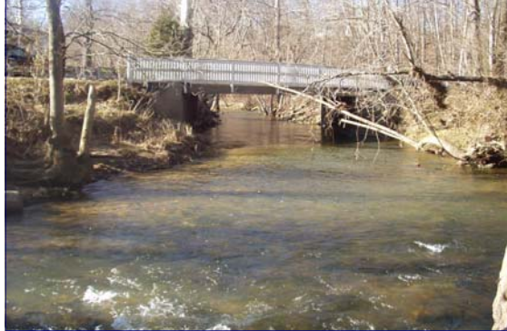
MINOR: Bottomless bridge (minor impact) causing negligible impacts to remainder of reach