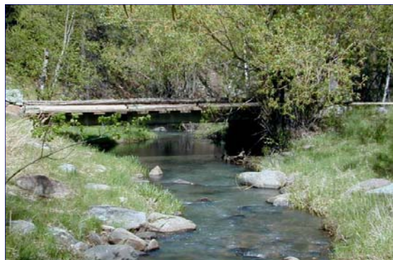
NEGLIGIBLE - Pedestrian Crossing not impacting stream