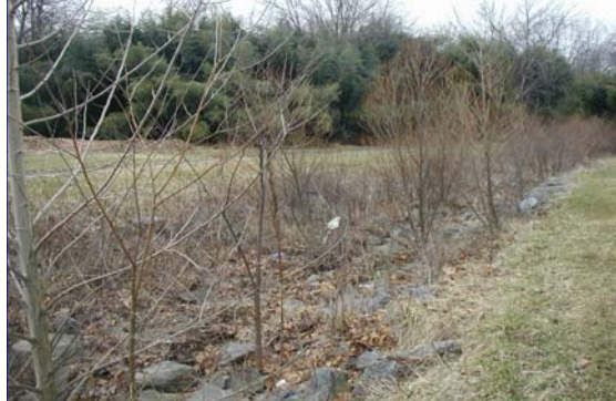
SEVERE: More than 60% of reach is stabilized with riprap