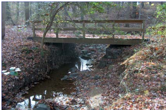
MODERATE: Bridge crossing causing significant bank erosion on over half of the reach