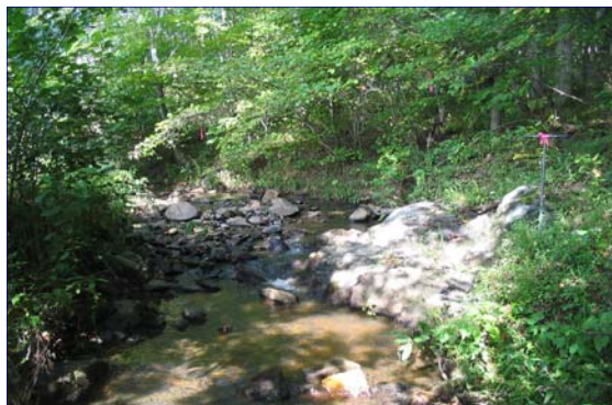
NONE - Stream with no impacts