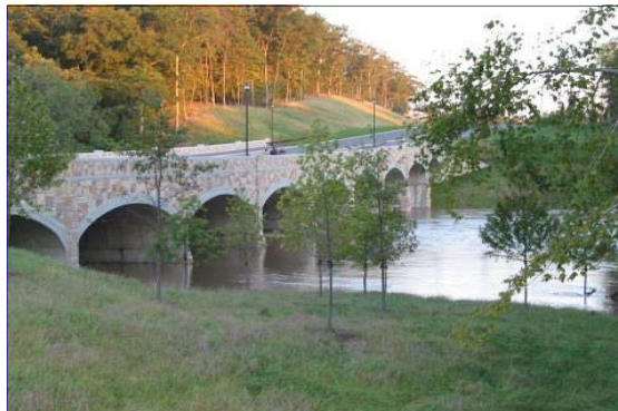
MINOR: Bottomless, multi-opening bridge (minor impact) causing negligible impacts to remainder of reach