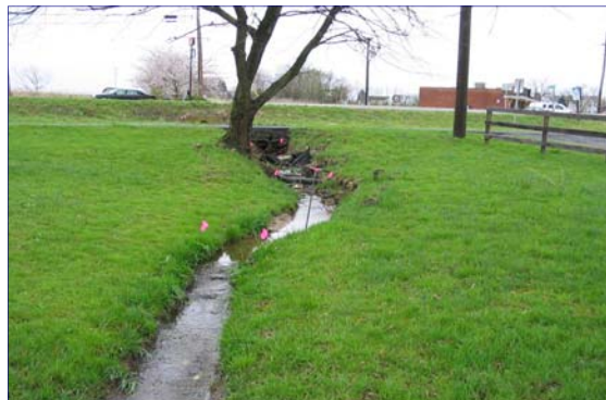
MODERATE: 30 - 60% of reach disrupted by culverts with recent channel straightening