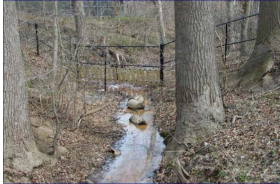
NEGLIGIBLE - Fence is not impacting the stream