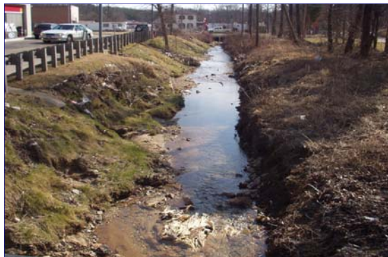
SEVERE: Reach is straightened and channelized with culvert disruption