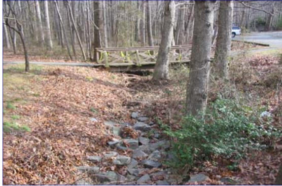
MODERATE: More than 30% of riprap in streambed and bridge