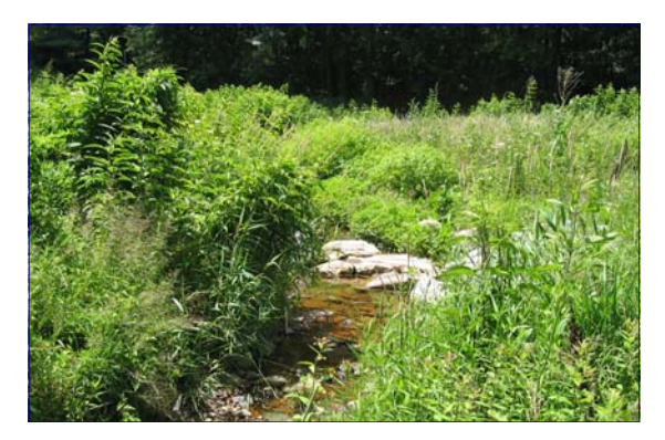
RF = 6.00: Northern Virginia, Urban/suburban stream restored utilizing Natural Channel Design techniques and no grade control structures.