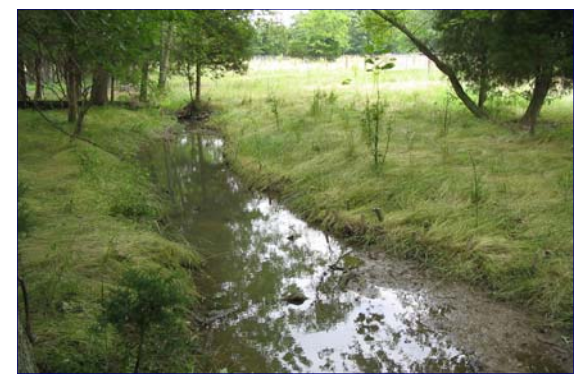
RF = 2.00: Northern Virginia, Rural stream with both banks stabilized utilizing bioengineering techniques. Coir logs are present along the toe of both banks.

RF = 1.25: Northern Virginia, Installation of livestock fencing and removal of non-native species, deep-disked, seeded and planted native trees and shrubs.