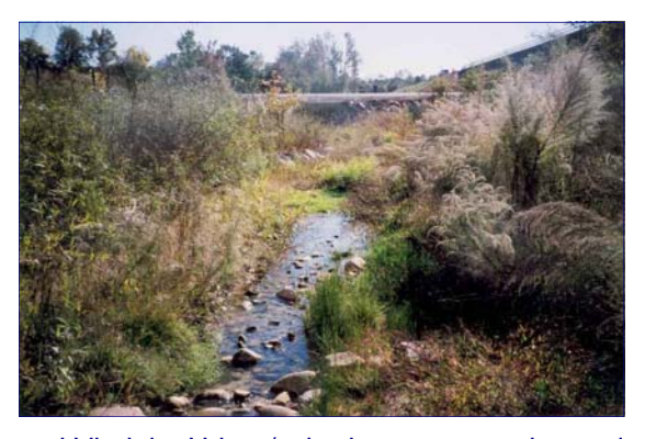
RF = 8.50: Central Virginia, Urban/suburban stream relocated and restored utilizing Natural Channel Design techniques, bed reinforcement, and grade control structures.