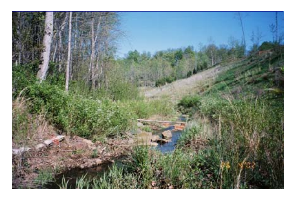
RF = 4.50: Central Virginia, Urban/suburban stream relocated and restored utilizing bioengineering techniques.

RF = 3.50: Western Maryland, Rural stream restored utilizing Natural Channel Design techniques and grade control structures.