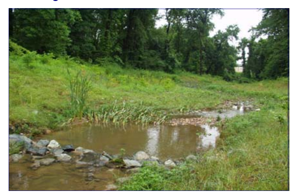
RF = 8.50: Northern Virginia, Urban/suburban stream restored utilizing Natural Channel Design techniques, bed reinforcement, and grade control structures.