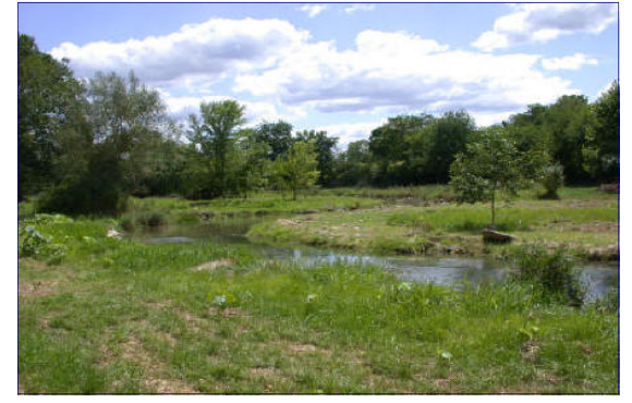
RF = 3.00: Central Pennsylvania, Rural stream restored utilizing Natural Channel Design techniques without grade control structures.

RF = 2.25: Northern Virginia, Urban/suburban stream utilizing bioengineering techniques on one bank. The right bank was regraded with biologs placed at the toe of the slope and the bank was replanted with native vegetation. Left bank has one segment of imbricated stone to save trees.