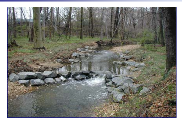
RF = 7.00: Northern Virginia, Urban/suburban stream restored utilizing Natural Channel Design techniques and grade control structures.